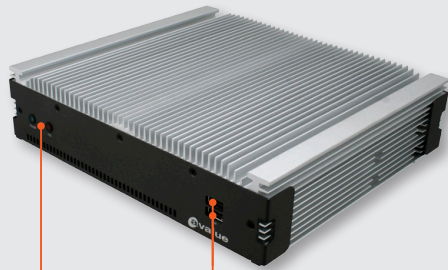
Power/ HDD LEDs 2 USB