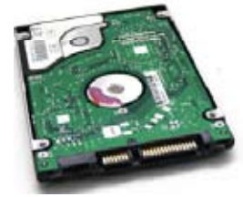
2.5" hard drive