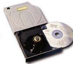
5.25" slim CD-ROM